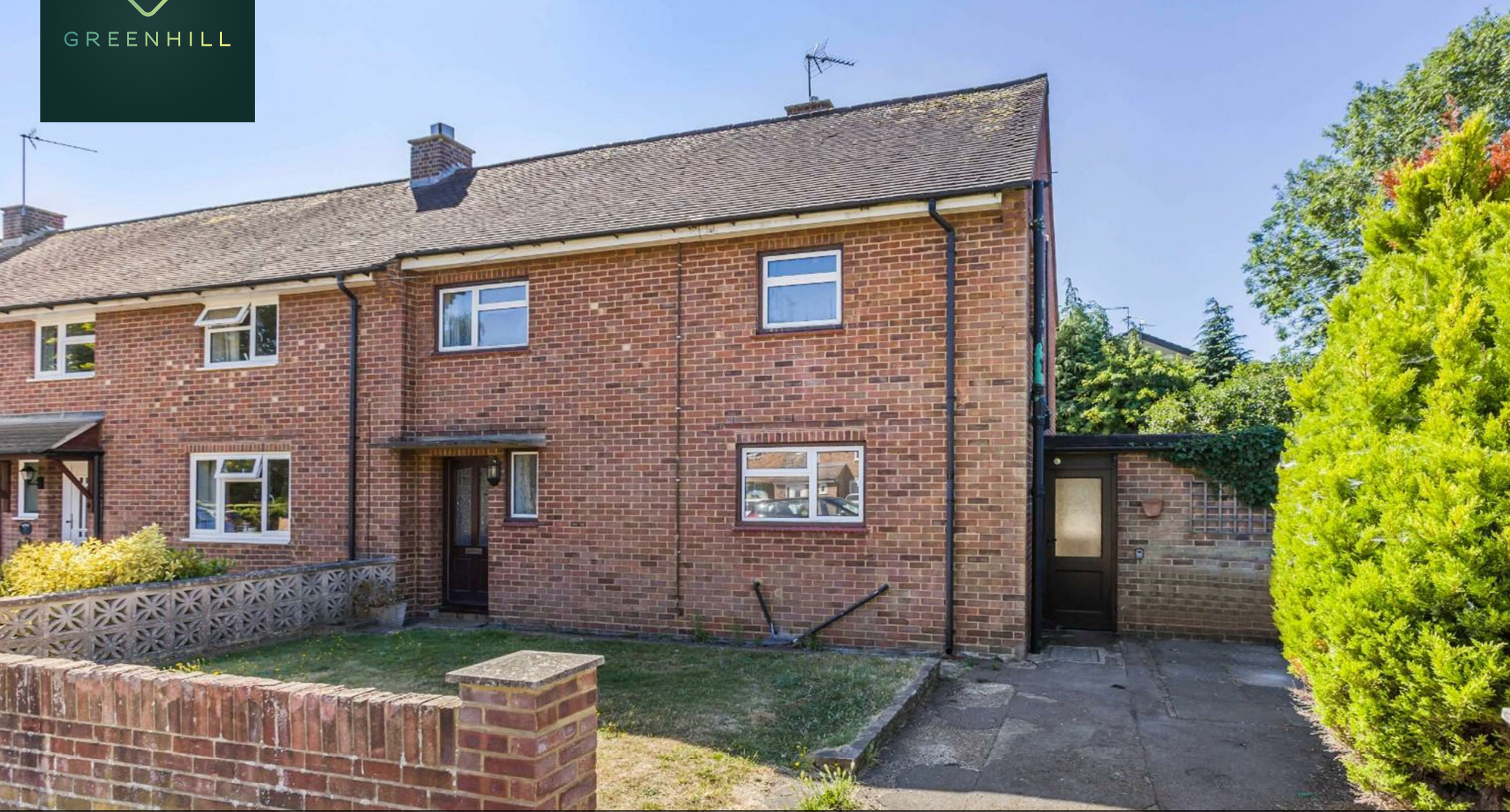
11 Chestnut Close , Bishop's Stortford, CM23 3SY £1,500